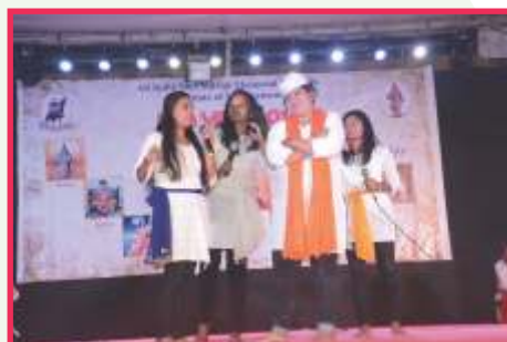
Drama by MBA Sem-IV Students