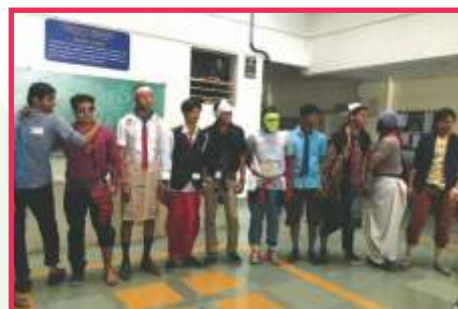
Face Painting Competition