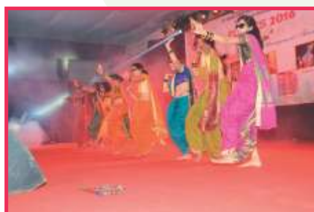
Dance Competition, MBA Sem-II Students