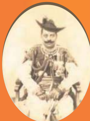
His Highness Shri Madhavrao Scindia Maharaj Maharaja of Gwalior