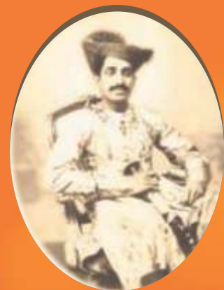
His Highness Sir Tukojirao Maharaj Maharaja of Indore