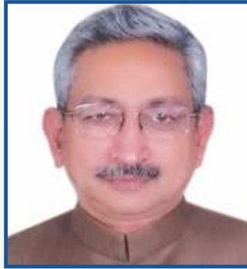
Shri Shahu Chhatrapati, Kolhapur President