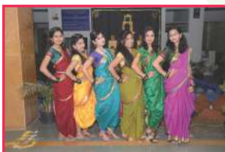
MBA Sem-II Students in Flames 2016