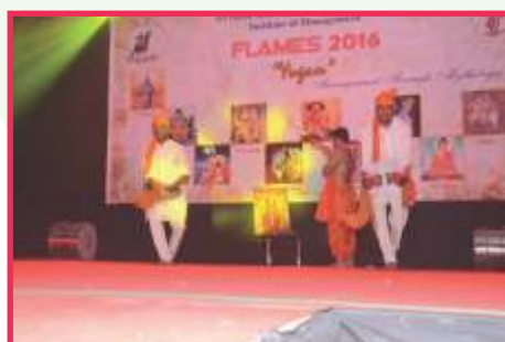
Dance Competition, MBA Sem-IV Students