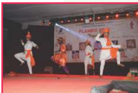
Performance of MBA Sem-IV Students