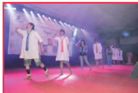
Performance of MBA Sem-II Students