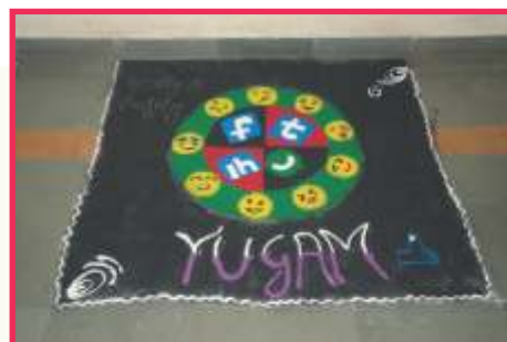
Flames 2016 : Decoration & Rangoli Competition