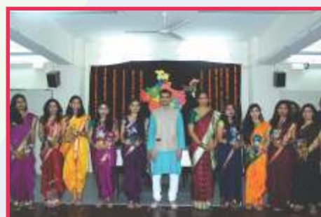
Traditional Day Celebration, MBA Sem-II Students