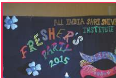
Fresher's Party 2015