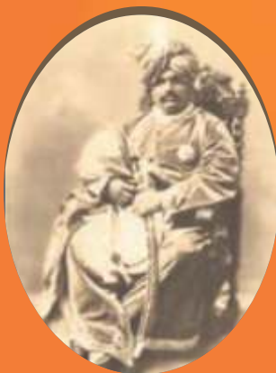
Rajarshi Chhatrapati Shahu Maharaj Maharaja of Kolhapur