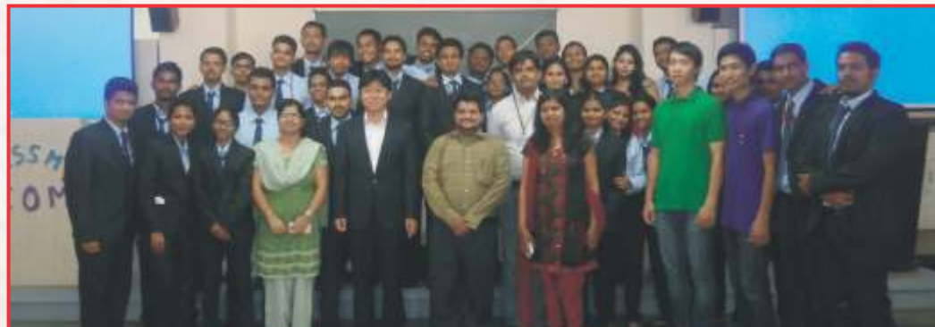
International Youth Forum