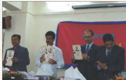
Introduction of 1 st Newsletter