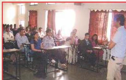
Guest Lecture - EDP