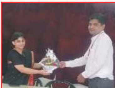
Seminar - BSE