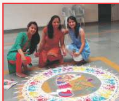
Gokul Ashtami Event