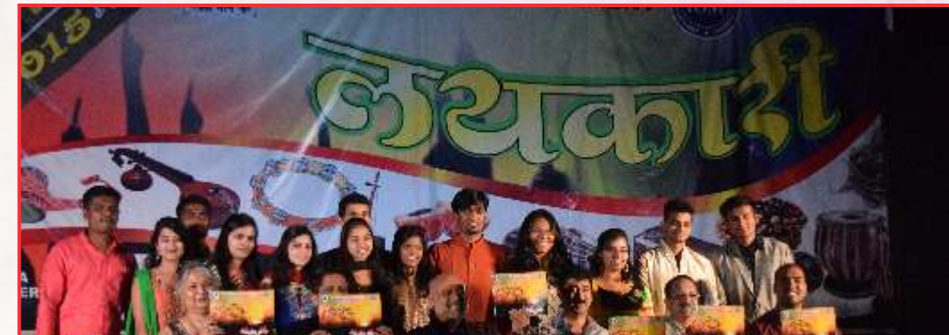
Release of Magazine "Flames 2015"