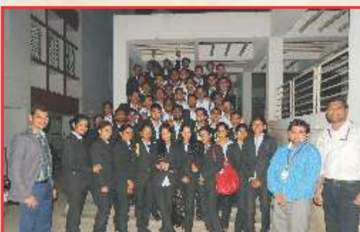
Industrial Visit to Parle Biscuits Pvt.Limited