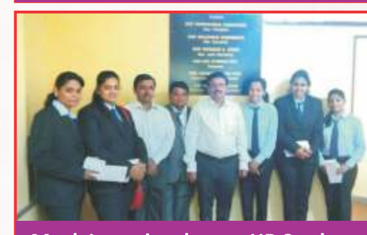
Mock Interview by our HR Students