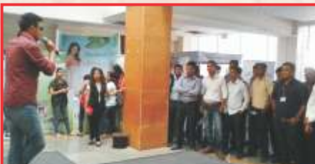
Radio Mirchi Event