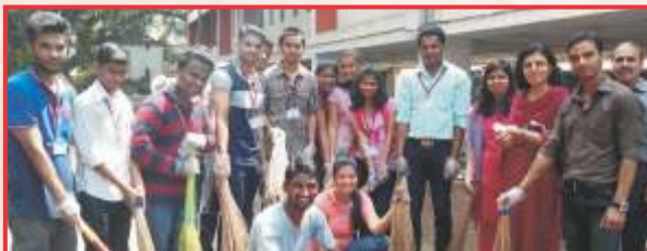
Swachha Bharat Abhiyan