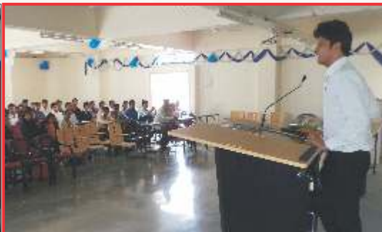
Seminar - Personality Development