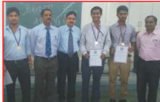
Business Standard Quiz