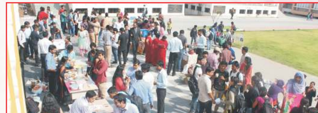
Biz Buzz - ED Cell Event